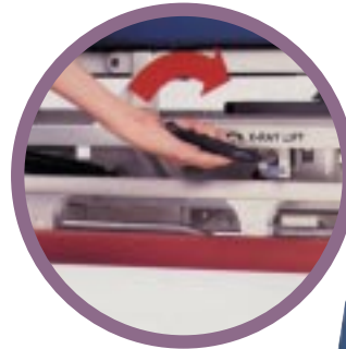
Full length standard X-ray cassette platform under sleep deck