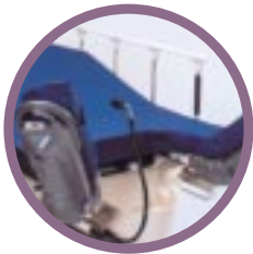
Optional fiber optic exam light