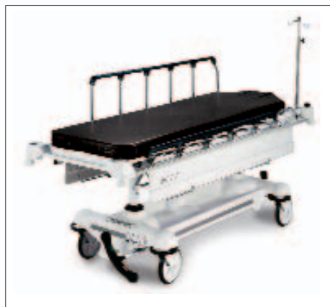
MODEL 720 (FIXED HEIGHT)